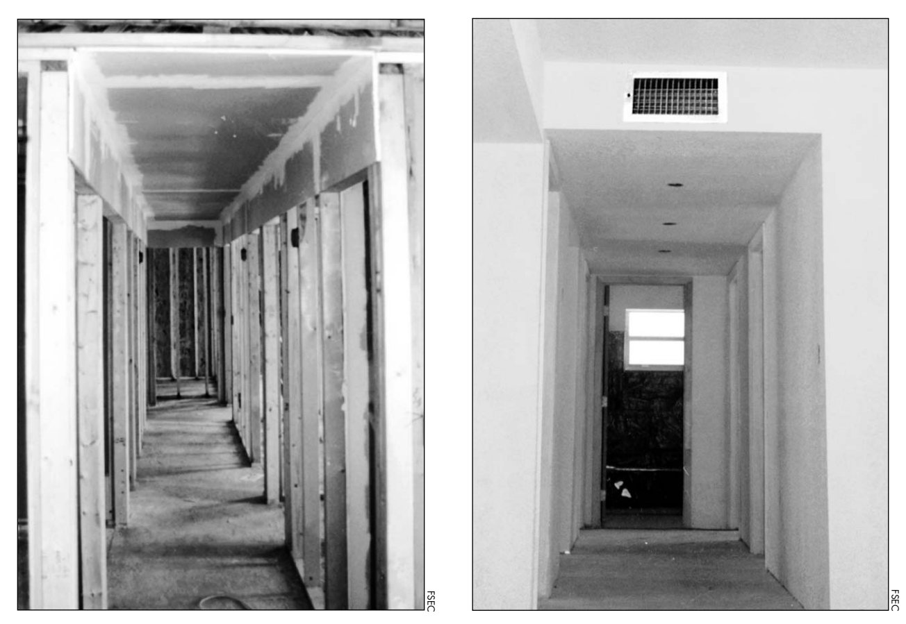
(left) This chase under construction in a ranch style home shows the sealing of the chase with drywall compound. (right) The completed chase.

air barrier and the top plates of adjacent walls (see Figure 1). At this point, the chase's principal air barrier is complete. The open sides facing conditioned space will be finished later when the rest of the house is drywalled.